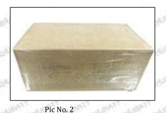
Domestic express packaging: Wrapped by Transparent tape black protective film